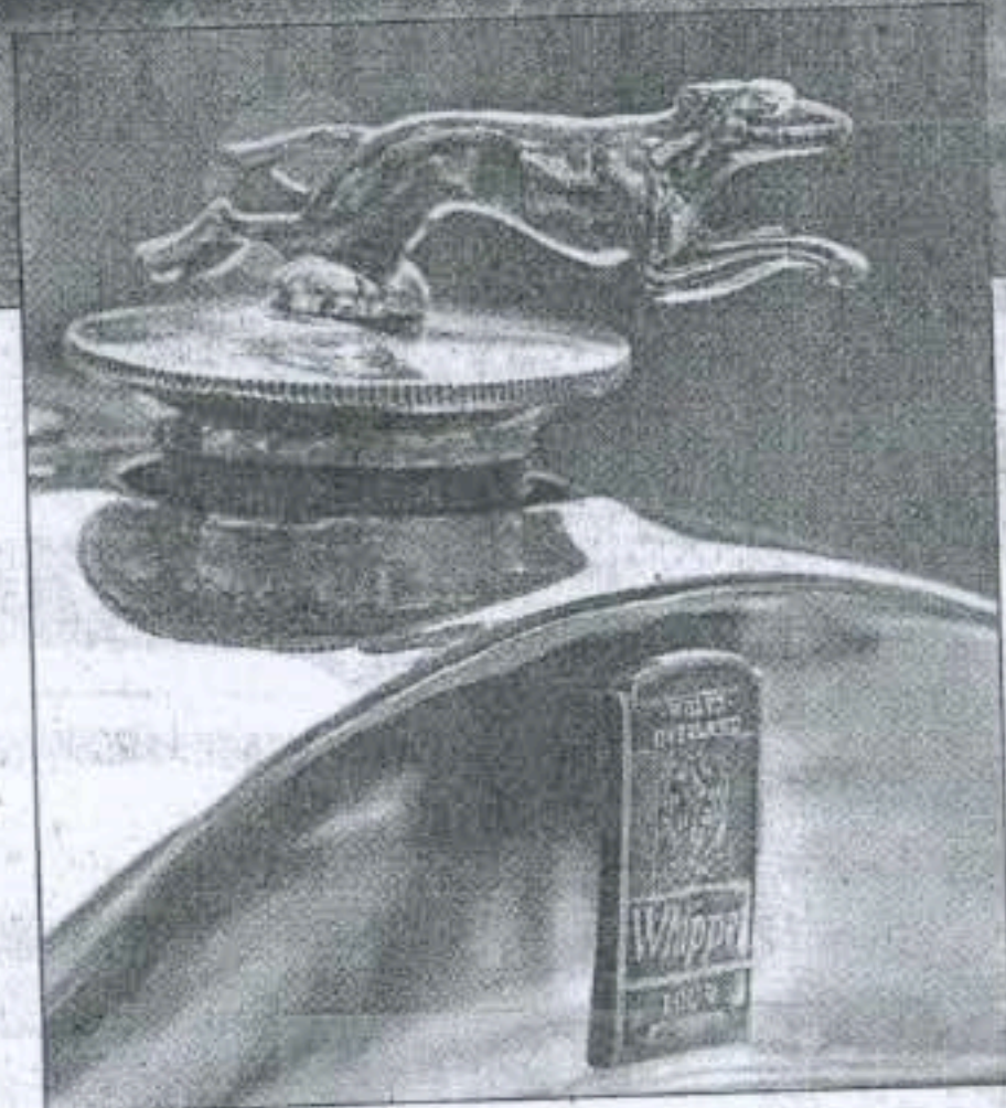
A whippet dog adorns the top of the radiator.

After traveling and getting kids through college, the Barneses turned their attention to the Whippet. A body was discovered at a swap meet, although it had been sawed in half to be used as a sign by a body shop in