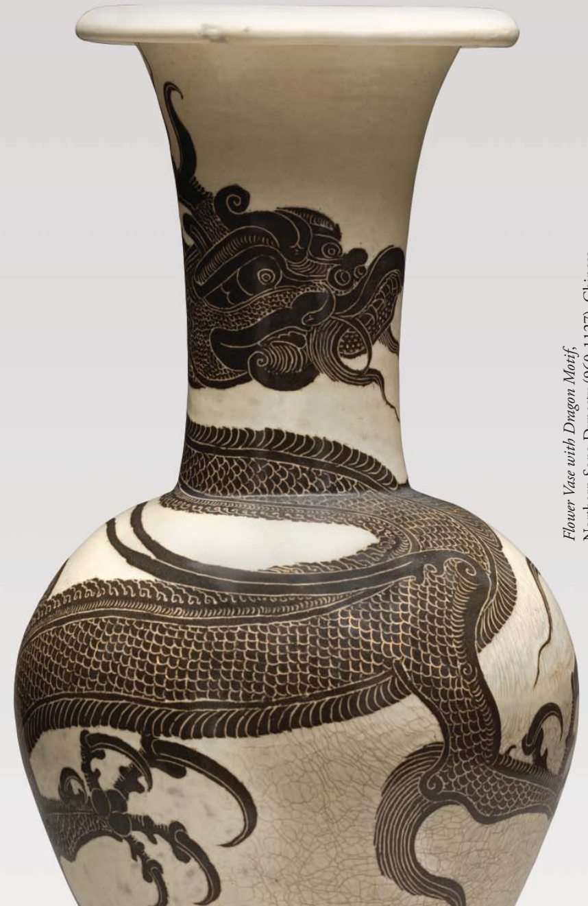
Flower Vase with Dragon Motif, Northern Song Dynasty (960-1127), Chinese