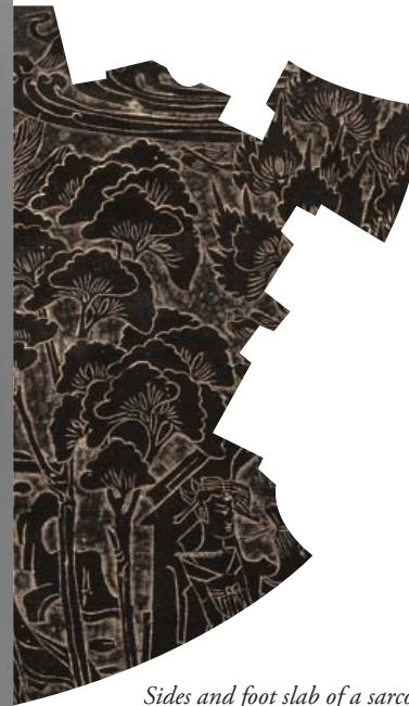
Sides and foot slab of a sarcophagus Northern Wei Dynasty (386-534 C.E.) ca. 525 C.E., Chinese