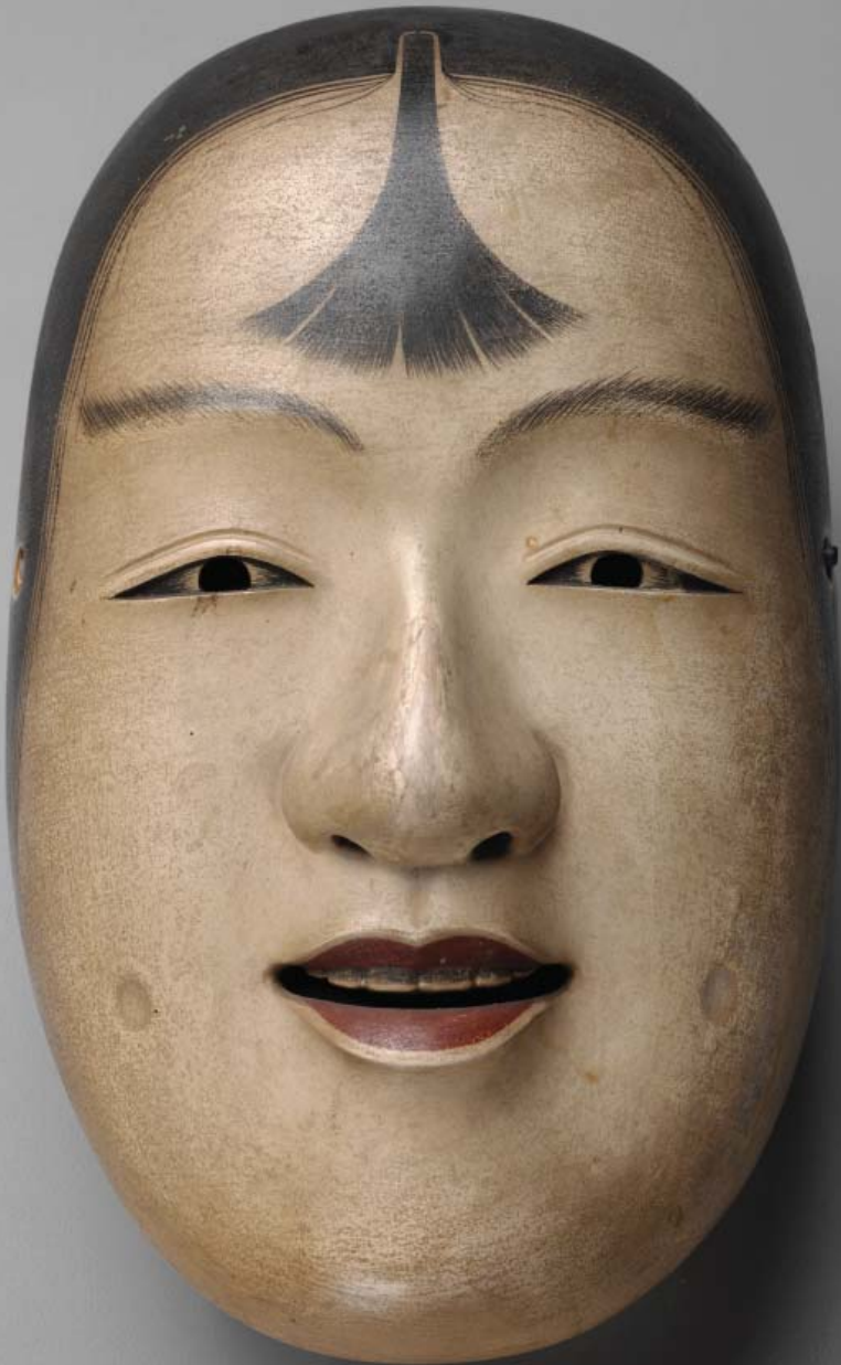
Nô mask of a youthful attendant (Kashiki), Early 19th century Japanese