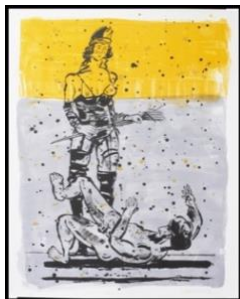
Language of Violence Version 2, 2018

Collection of Kansas City Art Institute; Gift of Jack Lemon