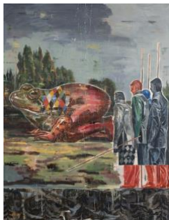
Night Watch, 2010-2014 oil on canvas