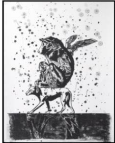
Revealing in the Transformation, 2018

Collection of Kansas City Art Institute; Gift of Jack Lemon