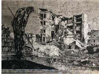
This Is Aleppo, No. 2 , 2018 ink on paper Courtesy of the artist and Taymour Grahne, London