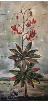
From environmental series, No. 4 , 2018 oil on canvas