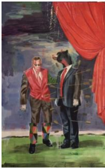
On going conflict , 2017 oil on canvas