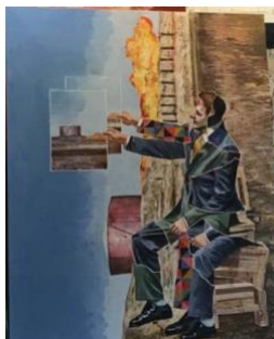
The end of the road , 2018 oil on canvas Courtesy of the artist and Taymour Grahne, London