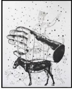
The Making of the Donkey, 2018