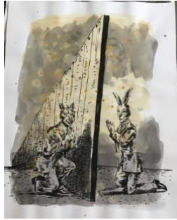
The Wall , 2014 ink and wash on paper Courtesy of the artist and Taymour Grahne, London