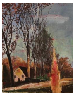
Untitled , 2018 oil on canvas Courtesy of the artist and Taymour Grahne, London