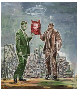
Good natured animal , 2015 oil on canvas