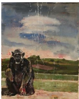
Untitled , 2018 oil on canvas