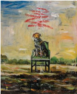
On the throne , 2016 oil on canvas