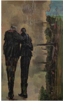
Unfinished business , 2017 oil on canvas

Nicky Nodjoumi: The Long Day January 25 - March 16, 2019