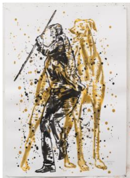
The Securities , 2013 ink and gouache on paper Courtesy of the artist and Taymour Grahne, London