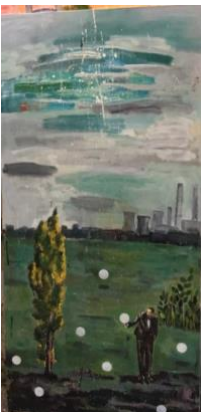
He finds himself alone , 2018 oil on canvas