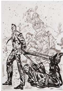
Untitled , 2012 ink on paper Courtesy of the artist and Taymour Grahne, London