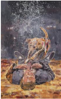
Intricate Relationship , 2014 oil on canvas Courtesy of the artist and Taymour Grahne, London