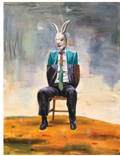
You and Me , 2015 oil on canvas