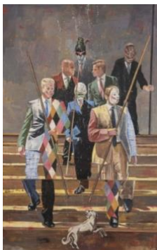
Men descending the stairs , 2015 oil on canvas Courtesy of the artist and Taymour Grahne, London