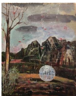
Untitled , 2018 oil on canvas Courtesy of the artist and Taymour Grahne, London