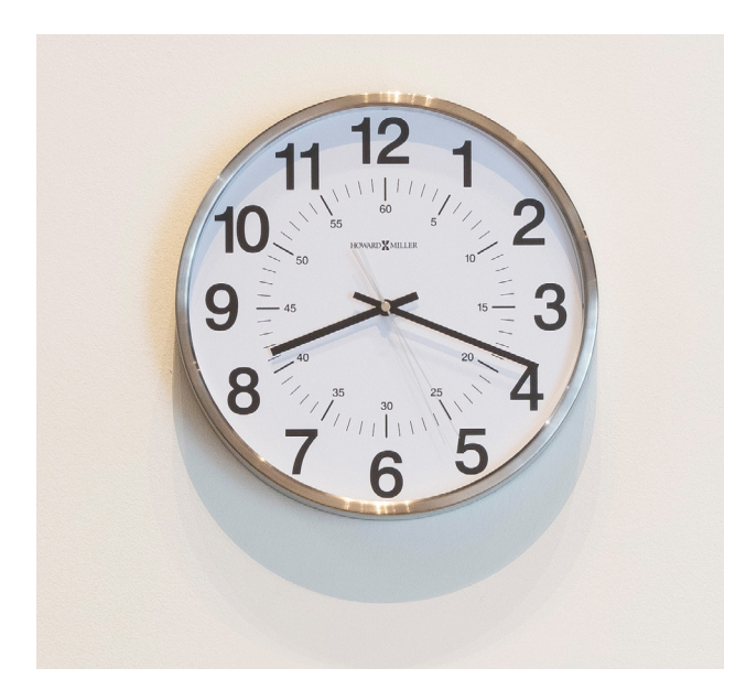
Jarrett Mellenbruch, The Eternal Question II, 2018 altered clock